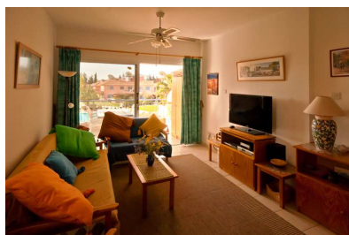
3-bed apt. living room

The living rooms have comfortable seating (two sofa-beds in 3-bed apt.), colour TV and music centre, dining table and chairs, coffee tables and lamps. There are board games, books and DVD/CD music tapes to keep you entertained and we also have a selection of tourist information leaflets and maps to help you plan your holiday. Broadband internet access is available, including internet TV – a great saving over use of internet cafes.