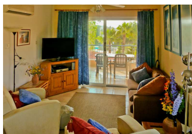
2-bed apt. living room